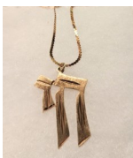
22"/14K Gold Chain with 14K Chai Pendant (1 1/4" x 1 1/2") - Spain, asking $325

The big sale may be over, but there are still some special items for sale! Check out the selection of high-end pieces still available for purchase and contact the JCF office if you're interested in purchasing one at 607-734-8122 or at office@jewishelmira.org .