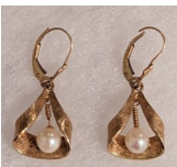
14K Earrings with Pearls 4/8" x 5/8" asking $110.