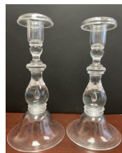
Steuben Glass Candlesticks $200. each