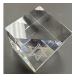
Steuben Glass Star of David paper weight $150.