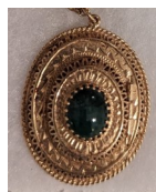
24" 14K Chain with 14K pendant (locket) asking $600