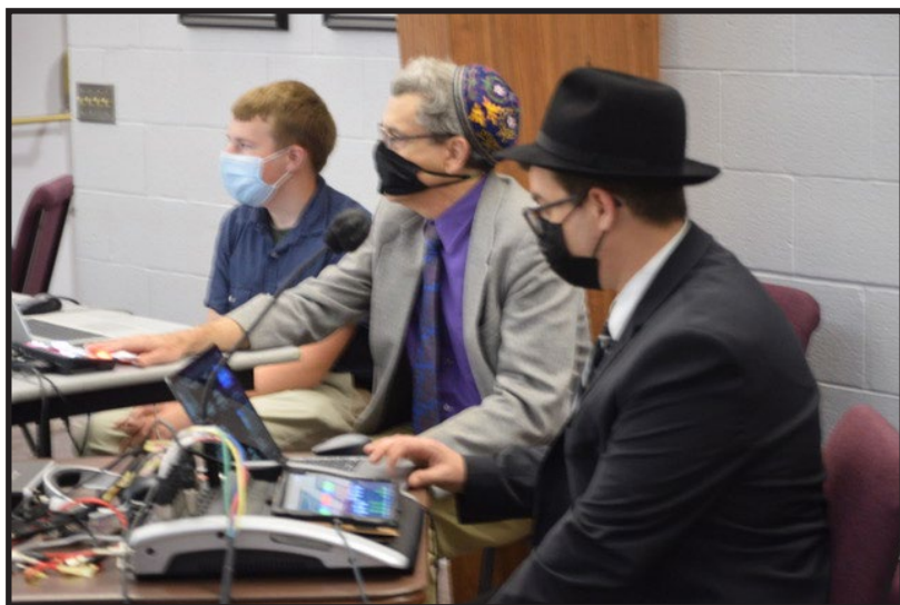
Command Central for online zoomers